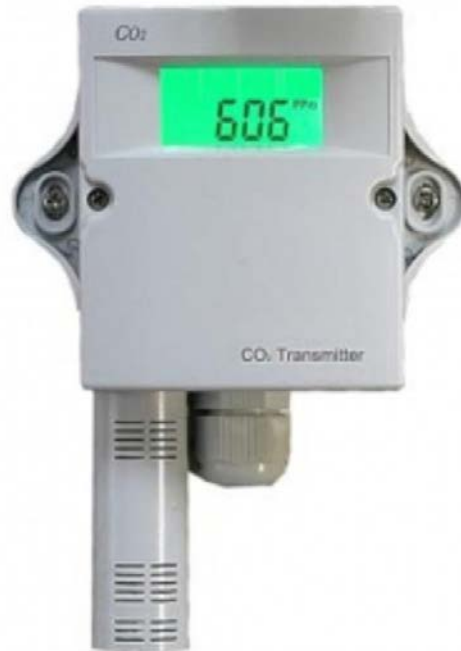
Product ID: TGPCO2118L Manufacture warranty period: 12 months